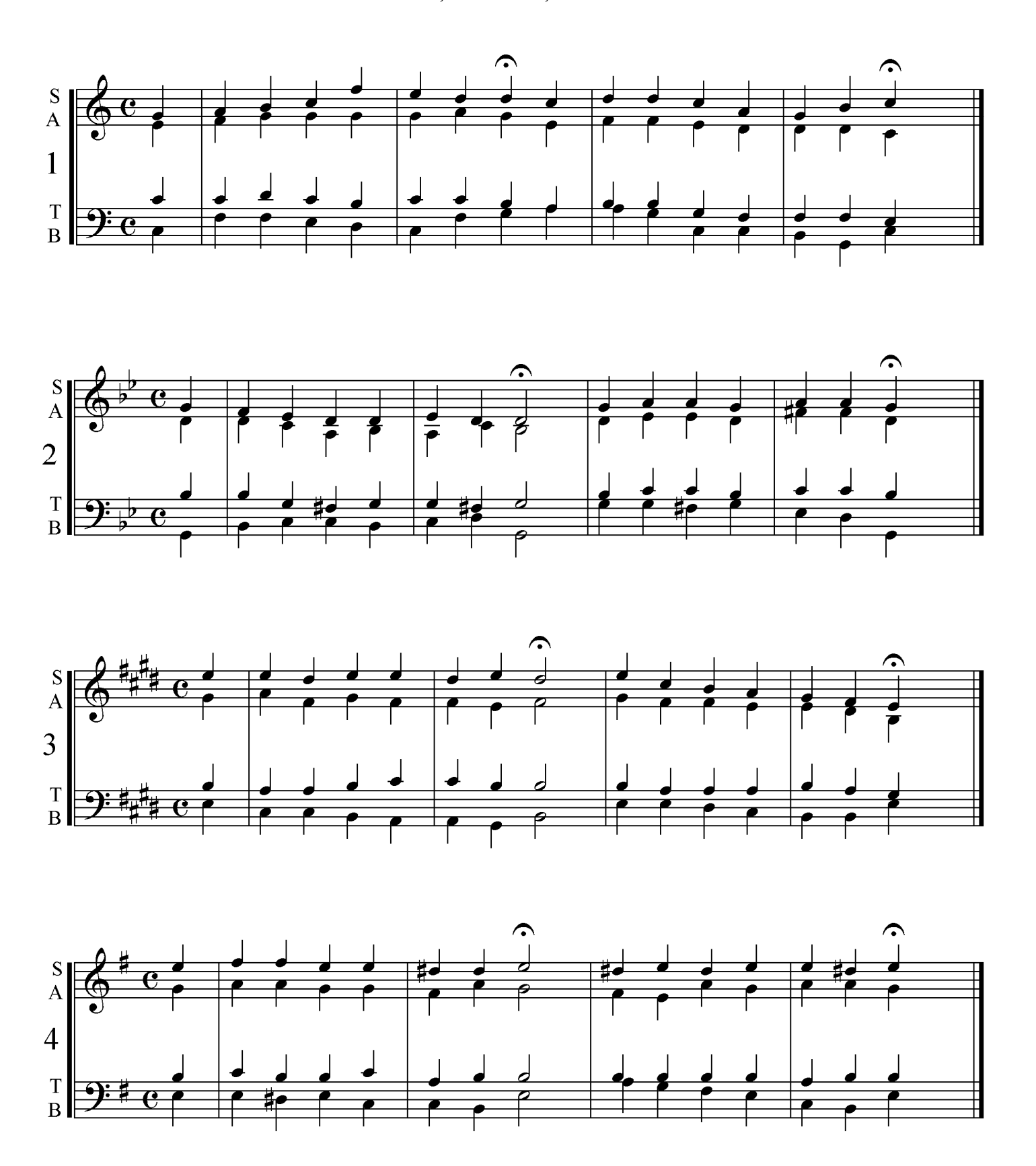
Page 2 of 2